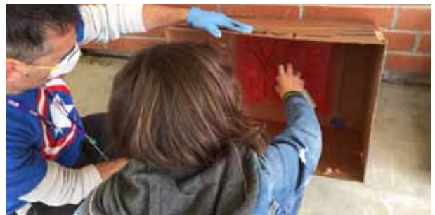
Social Justice Stencil Art and Papercutting