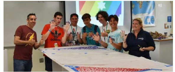
Inter-Generational Tallit Projects